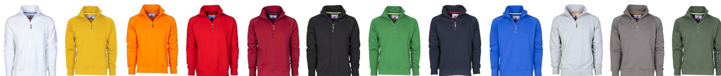
BIANCO GIALLO ARANCIONE ROSSO BORDEAUX NERO JELLY GREEN BLU NAVY BLU ROYAL GRIGIO MELANGE SMOKE VERDE